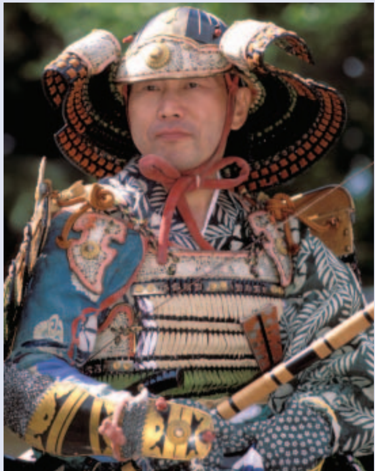
FIGURE 13-10 Although this image of a samurai is modern, the armour is very similar to that which would have been worn in Edo Japan. Why do you think the image of the samurai is so appealing even now in Japanese society?