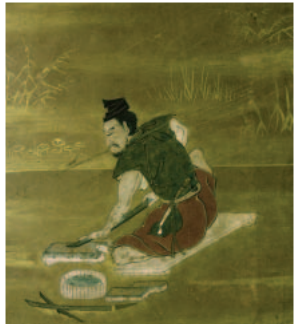
FIGURE 13-12 This late 16th century print of a swordsmith was done by an unknown artist. Swordsmiths were the most honoured of all artisans. What does this suggest about the Japanese worldview?

The lives of farmers in Edo Japan were similar to those of peasants in medieval Europe. ■