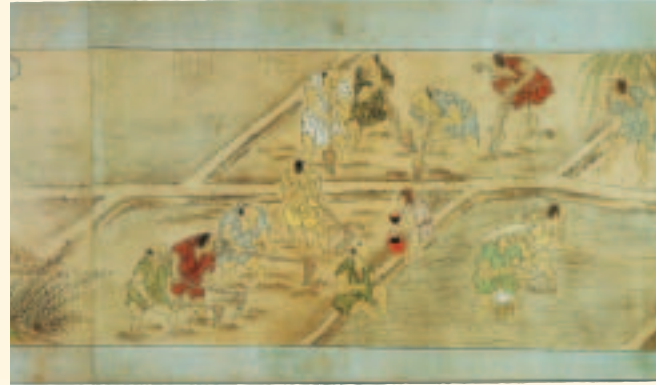
FIGURE 13-11 This late 16th century print by an unknown artist shows peasant farmers working in the fields.