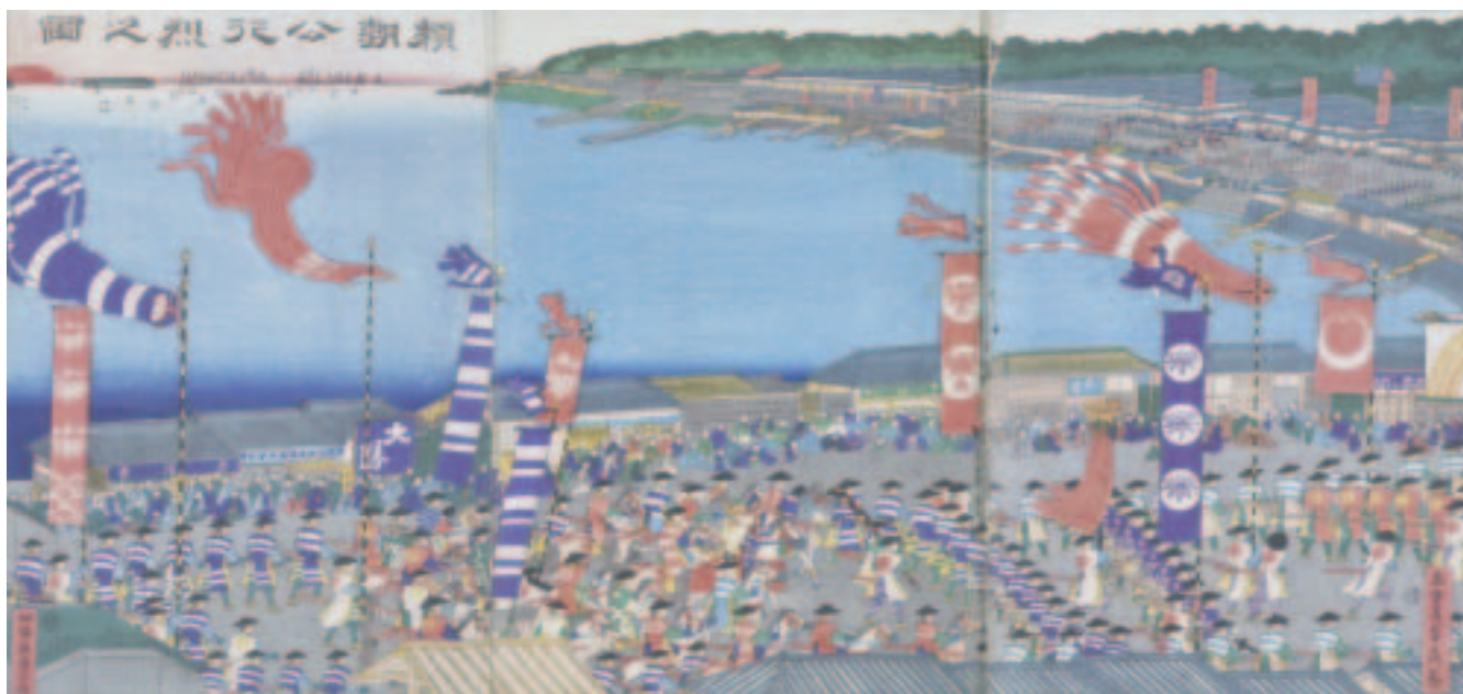
FIGURE 13-4 This woodblock print by Utagawa Sadahide created in the mid-19th century shows Yoritomo, a daimyo, and his attendants setting off to go to his domain. What does this image tell you about the power and wealth of the daimyo?