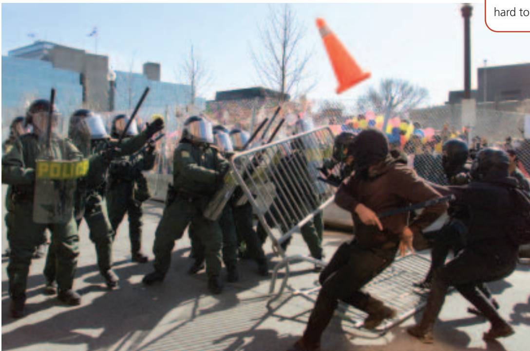
FIGURE 13-17 Sometimes the sense of duty of different groups of people can lead to conflict and even violence. This 2001 photograph shows an angry confrontation between protesters and police. In this case, the protesters felt that it was their duty to demonstrate against a free trade conference being held in Québec City. The police had a duty to follow the Prime Minister’s orders to remove the protesters from the area of the conference.

In what situations do you think that it is your duty to submit to the rules made by people in authority over you? In what situations do you think that you need to stand up for your rights as an individual? Is it sometimes hard to know the difference?