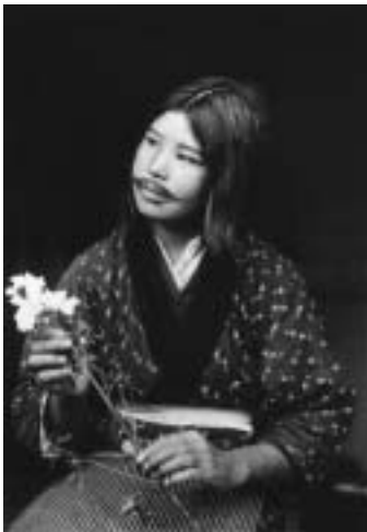
FIGURE 13-16 A young Ainu woman in traditional dress. How do her clothes and tattooed lips emphasize the differences between the Ainu and other Japanese people?