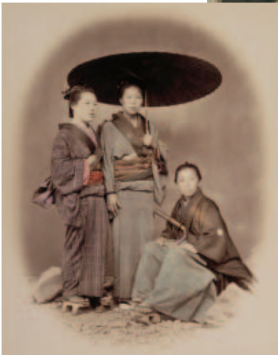
FIGURE 13-14 A mother and her two children. Her son, seated, is in samurai dress.