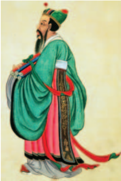
FIGURE 13-18 Confucius lived between approximately 551 and 479 B.C.E.

The teachings of Confucianism played an important role in the Japanese acceptance of class distinctions. Confucius was a Chinese scholar whose teachings for moral, that is right, living were brought over to Japan by Buddhist monks. Confucianism taught that everyone had a proper place in society. If everyone accepted their duties and obligations, there would be peace and order. If not, there would be chaos and suffering.