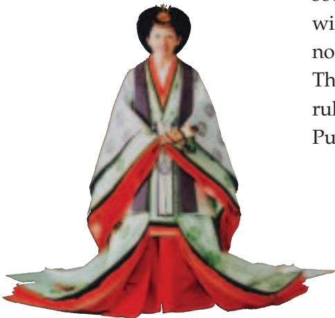
FIGURE 13-6 Empress Michiko wore a traditional 12-layered robe to her Enthronement Ceremony in November 1990. This garment severely restricts the wearer's movement. What might this suggest about women's role in upper-class society?

Strict rules governed the behaviour of each class. There were 216 rules regulating dress for everyone from the emperor to the lowest member of society. For example, an upper-class woman had to wear 12 silk kimonos with an exact combination of colours showing. In contrast, peasants were not allowed to wear clothing made of silk, even if they were silk farmers. There were rules regarding houses and possessions. There were even rules that dictated to whom each person had to bow and how low. Punishments were harsh for anyone who disobeyed.