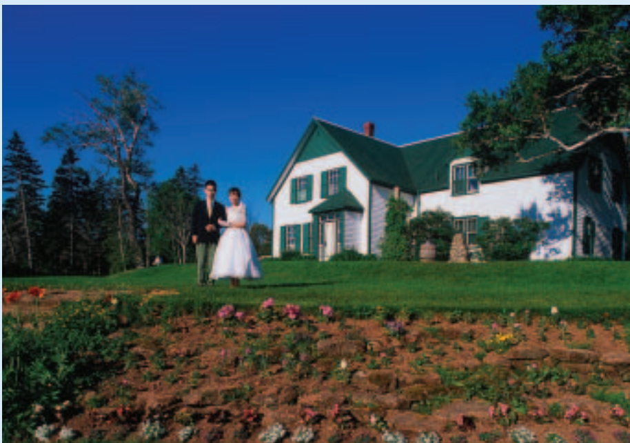
FIGURE 13-20 The Japanese are great fans of Anne of Green Gables. The Green Gables house on Prince Edward Island is a popular place for Japanese couples to get married. Why do you think that many Japanese people might be intrigued by this character who is a symbol of individuality?