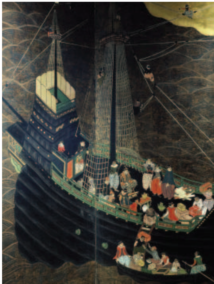
FIGURE 13-22 This folding screen by an unknown artist was done in the 17th century. It shows a Portuguese ship unloading goods. The Japanese had never seen people like the Portuguese sailors, nor had they seen vessels like the ships they sailed. In this painting, what elements does the artist emphasize as looking strange? What is shown in a more traditional way?

In Chapter 5, you read about Portuguese explorers who set up trading ports in areas around the Indian Ocean. During this time, in 1543, a Portuguese ship was wrecked off the shore of a small Japanese island. The Portuguese sailors said that they had come to exchange “what they had for what they did not have”; in other words, they were traders. Because they approached Japan from a southerly direction, the Portuguese became known as the “southern barbarians.” They were soon followed by Spanish, Dutch, and British traders and by Christian missionaries.