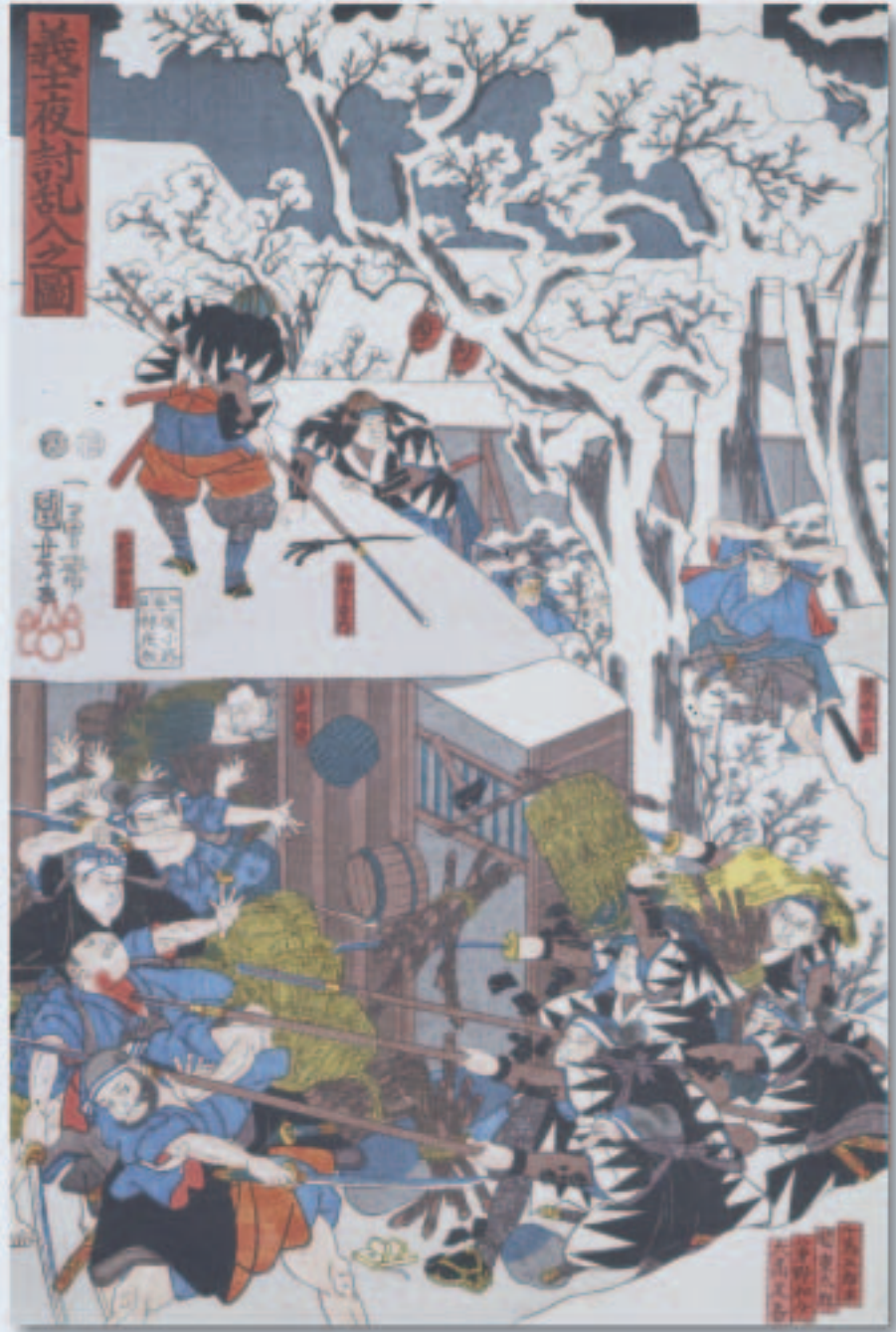
FIGURE 13-1 The story of the 47 ronin has been made into many plays, movies, and books in Japan as well as in other countries. Why do you think this is so?