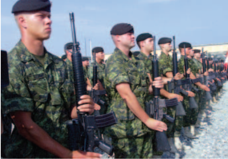
FIGURE 13-21 In the armed forces, individuals are placed in groups, and in many situations the whole group is responsible for the behaviour of each member. Of what groups are you a member? In what ways do members of these groups help one another and share responsibility and/or blame?