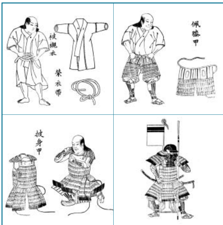
FIGURE 13-9 Putting on samurai armour was a complicated and time-consuming procedure that involved many stages. Four stages of the procedure are shown here.

Although they had privilege and status, samurai were forbidden to become involved in trade or business. In peacetime they were posted as officers in rural towns and took various duties, including surveying land, collecting taxes, and keeping order. The samurai code of honour dictated that they live simple and thrifty lives. In reality, they had little choice.