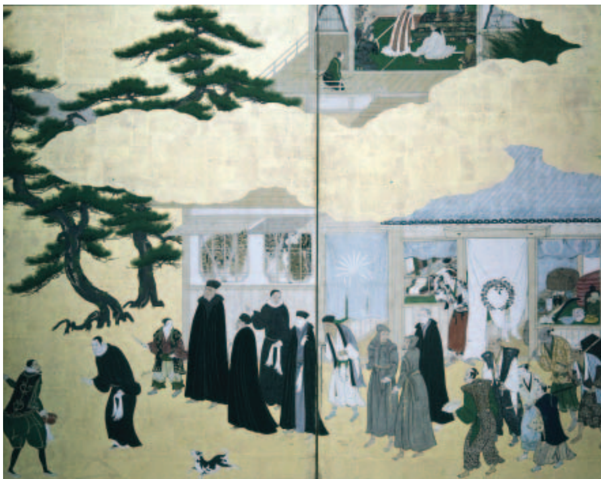
FIGURE 13-23 This six-fold screen was done in the early 17th century by Naizen Kano. It shows the Franciscans in grey and the Jesuits in black.

European objects and styles became fads in Japan. The upper classes wanted the velvet and satin capes, golden medallions, candlesticks, hourglasses, and fur robes they saw the Portuguese using.