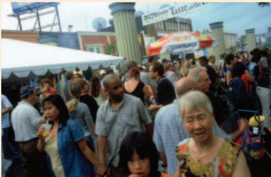
FIGURE 13-7 What does this street festival suggest about social mobility in this Canadian city?