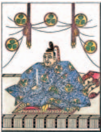
FIGURE 13-3 This contemporary woodblock print shows Tokugawa Ieyasu in traditional Japanese style, with a stiff, angular robe and realistic face. What impression of the shogun do you think the artist is trying to convey?

The Tokugawa shoguns, because they all have the same surname, are referred to by their given name, for example, Tokugawa Ieyasu is called “Ieyasu.”