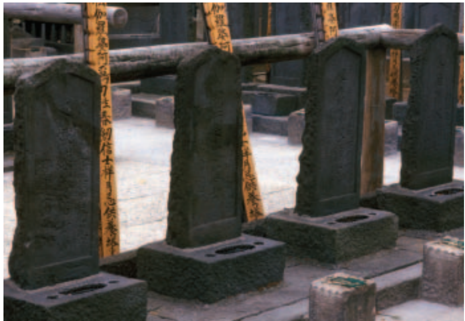
FIGURE 13-2 These are the graves of the 47 ronin. Every year on December 14, the anniversary of the attack on Lord Kira, Japanese people honour the memory of the 47 ronin.