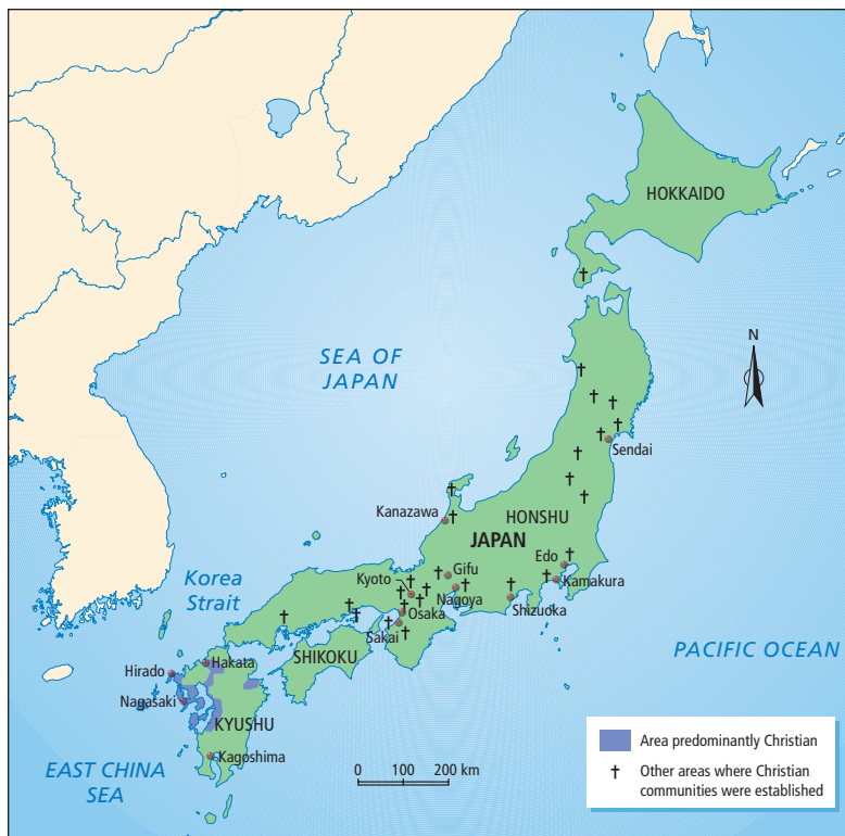
FIGURE 13-24 Christian Areas and Communities of Japan Around 1640. What can you tell about the spread of Christianity in Japan from this map? As you will see on page 306, the shogun began to persecute Christians in 1614.