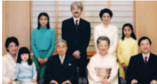
FIGURE 13-8 The emperor, empress, and their family. How is the role of Japan's imperial family today similar to its role in the Edo period?