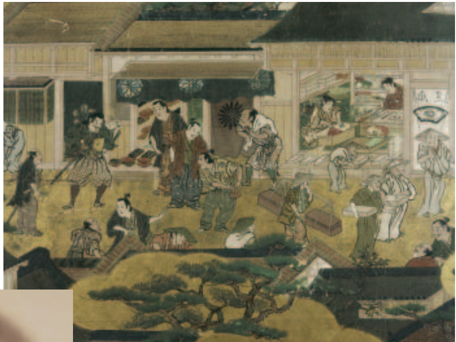
FIGURE 13-13 This street scene in early Kyoto shows merchants displaying fans and lacquer wares. It is from a screen called Famous Places in Kyoto done in the early 17th century by an unknown artist. Can you guess the class of any of the shoppers or people on the street? Explain your thinking.

Since they didn't actually produce anything, merchants were officially at the bottom of the social order. They had to live cautiously, as government spies reported merchants who showed off their wealth or dared to criticize the government. The government could punish them by confiscating, or taking over, their businesses.