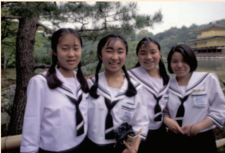
FIGURE 13-19 These are middle school students in Kyoto, Japan. Given what you have learned about the Japanese, how do you think these students feel about wearing uniforms?